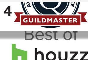
4 Company News