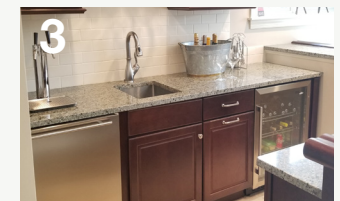
3 How to do Happy Hour at Home