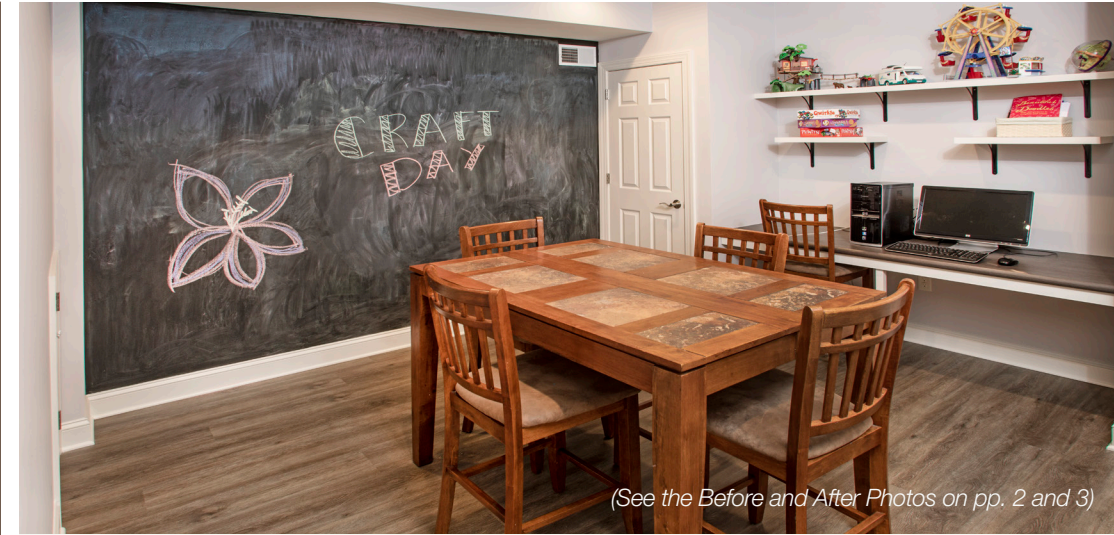
(See the Before and After Photos on pp. 2 and 3)