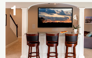
1 A Basement Renovation in Lower Gwynedd