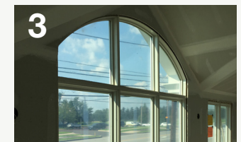
Renovations Progressing on New Custom Craft Office