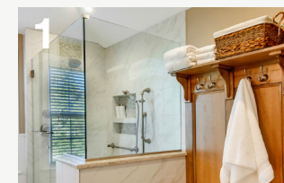
Souderton Master Bath Transformed for Form & Function