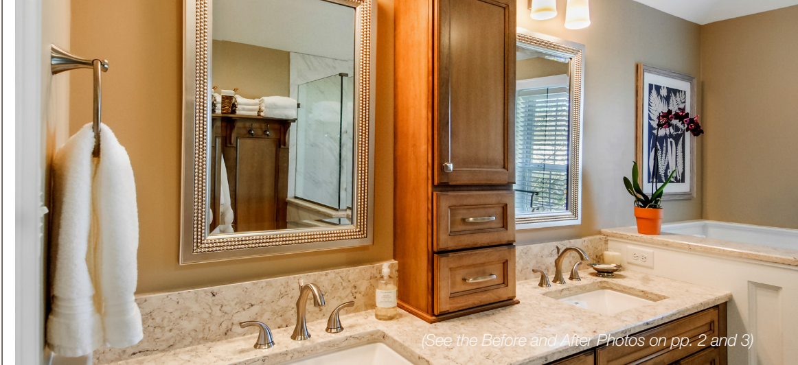
(See the Before and After Photos on pp. 2 and 3)