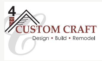
Join Us for an Open House