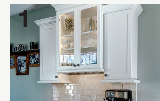
From Frustrating to Functional