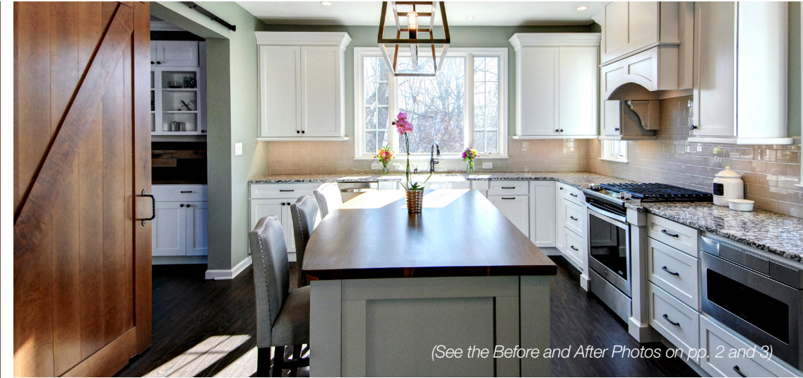
(See the Before and After Photos on pp. 2 and 3)