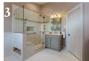
Harleysville Master Bath with Freestanding Tub: A Modern Take on a Vintage Classic