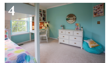
Virtual Learning Space